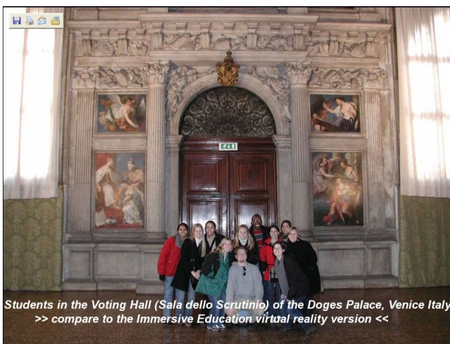
Students in the Voting Hall (Sala dello Scrutinio) of the Doges Palace, Venice Italy >> compare to the Immersive Education virtual reality version <<

“innovative, promising technologies which hold the potential to significantly affect society in the near future”