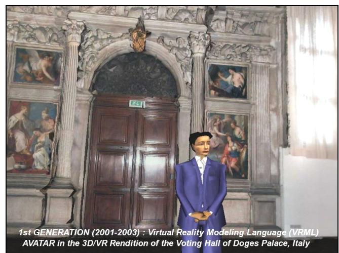
1st GENERATION (2001-2003) : Virtual Reality Modeling Language (VRML) AVATAR in the 3D/VR Rendition of the Voting Hall of Doges Palace, Italy