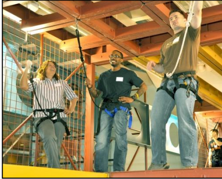
Photo from 2011 Retreat

The Honors Winter Retreat will held February 17, 2011 at the Regional Technology Center. Honors Program students as well as faculty will meet the challenge of the high ropes course. Other retreat activities offered will help attendees' develop communication, team-building, and problem-solving skills. Additional information on this event will be forthcoming ...