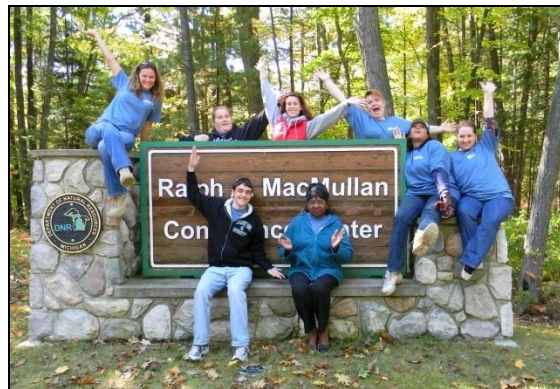
MCC students at MacMullan Center