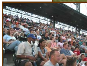
Comerica Park - Detroit, Michigan.