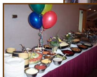
2004/05 TRiO-SSS Banquet at Walli's Restaurant East .....